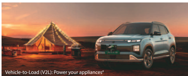
Vehicle-to-Load (V2L): Power your appliances*