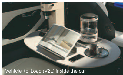
Vehicle-to-Load (V2L) inside the car