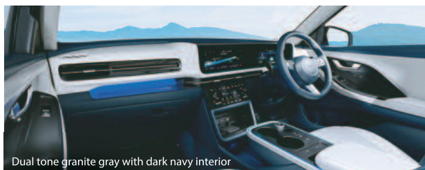
Dual tone granite gray with dark navy interior

Hyundai Bluelink (70+ connected car features)