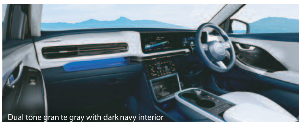
Dual tone granite gray with dark navy interior

Hyundai Bluelink (70+ connected car features)