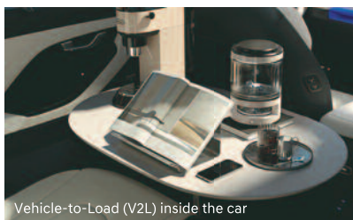
Vehicle-to-Load (V2L) inside the car