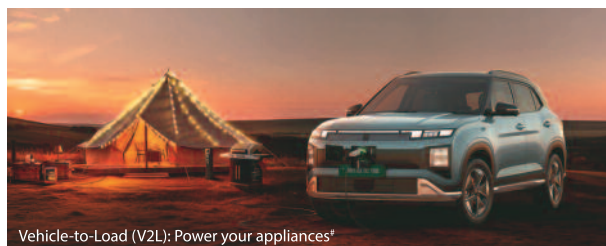
Vehicle-to-Load (V2L): Power your appliances*