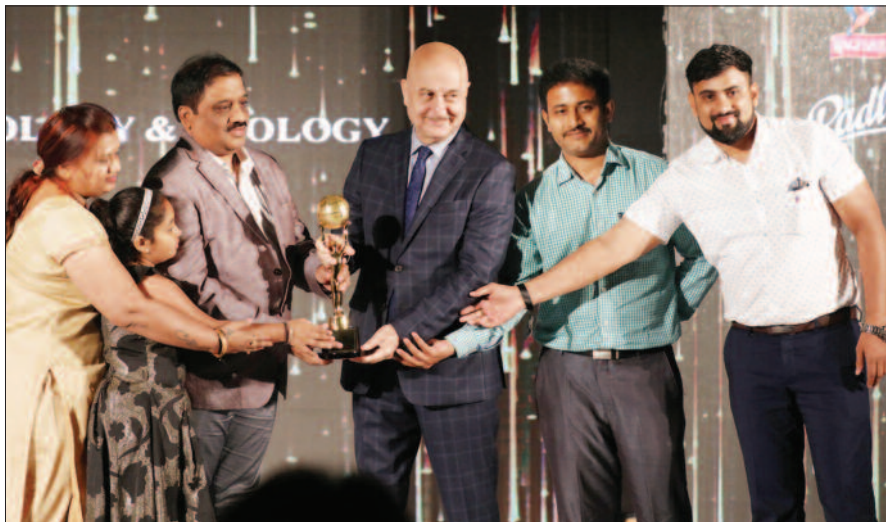
Esteemed moment of receiving Times Business Award 2019 from legendary artist Anupam Kher by Sri Lakshmi Super Speciality Hospital team.