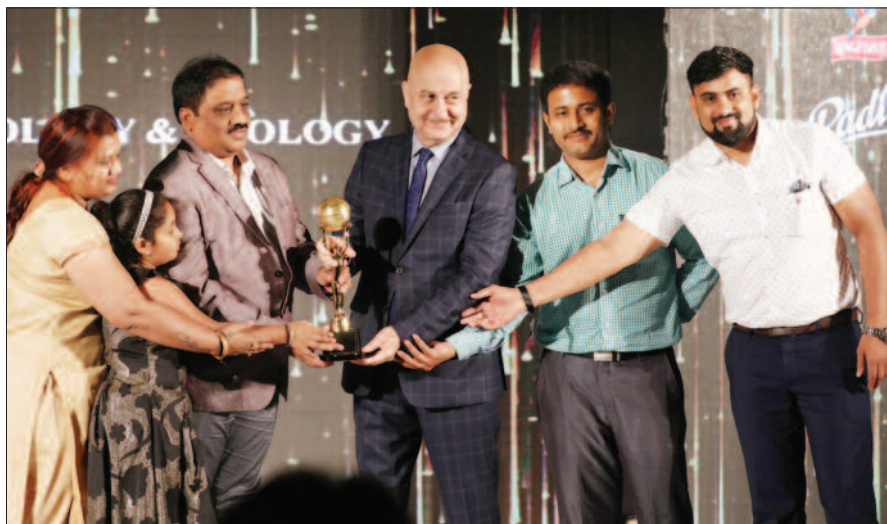
Esteemed moment of receiving Times Business Award 2019 from legendary artist Anupam Kher by Sri Lakshmi Super Speciality Hospital team.